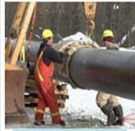
Oil gas pipeline preheat