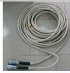
Flexible air-cooled inductor cable.