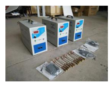
CX2015A 50-120KHZ 15KVA 34A