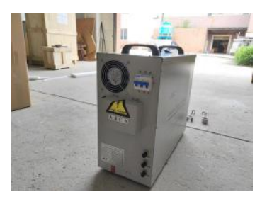
CX2030C 50-120KHZ 30KVA 23A