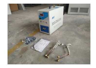
CX2020A 50-120KHZ 20KVA 45A